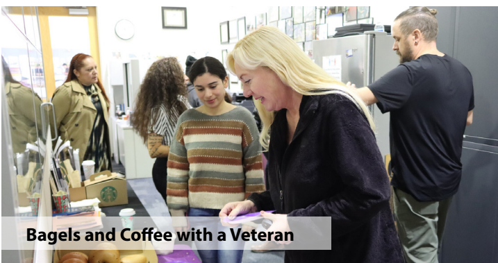
Bagels and Coffee with a Veteran