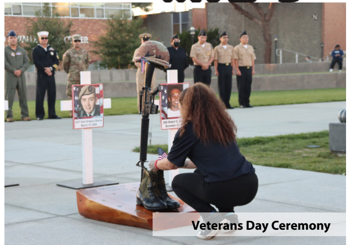
Veterans Day Ceremony