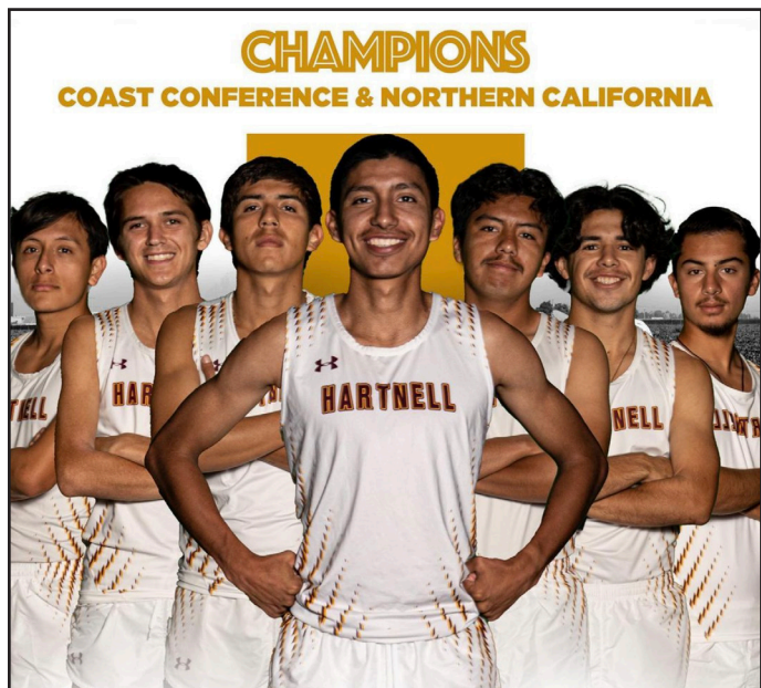
Congratulations to the Men's Cross Country team on being named back to back Coast Conference and Northern California Champions