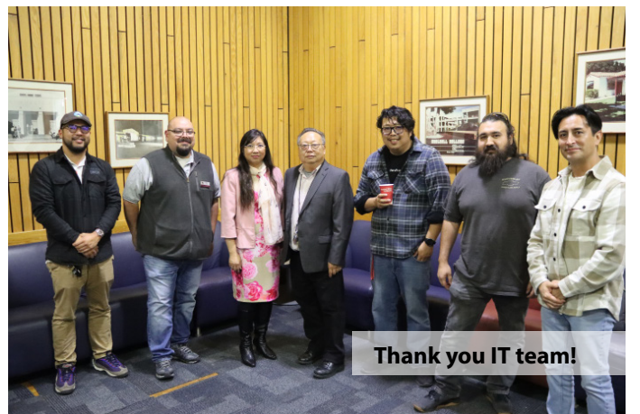
Thank you IT team!