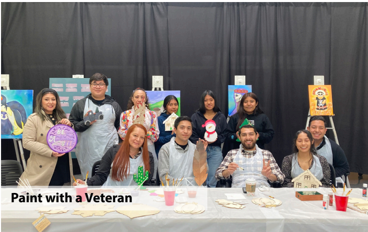
Paint with a Veteran