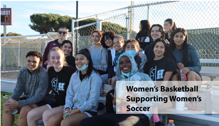
Women's Basketball Supporting Women's Soccer