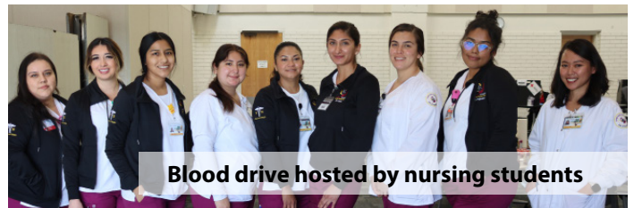
Blood drive hosted by nursing students