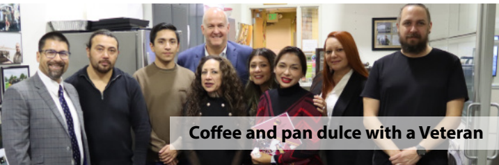
Coffee and pan dulce with a Veteran