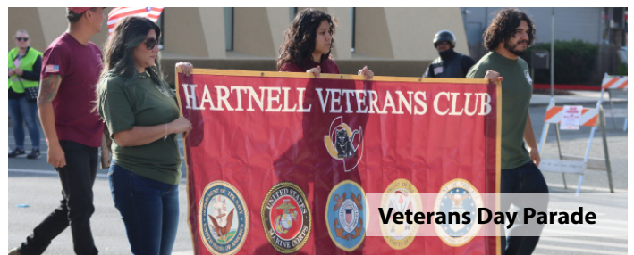
Veterans Day Parade