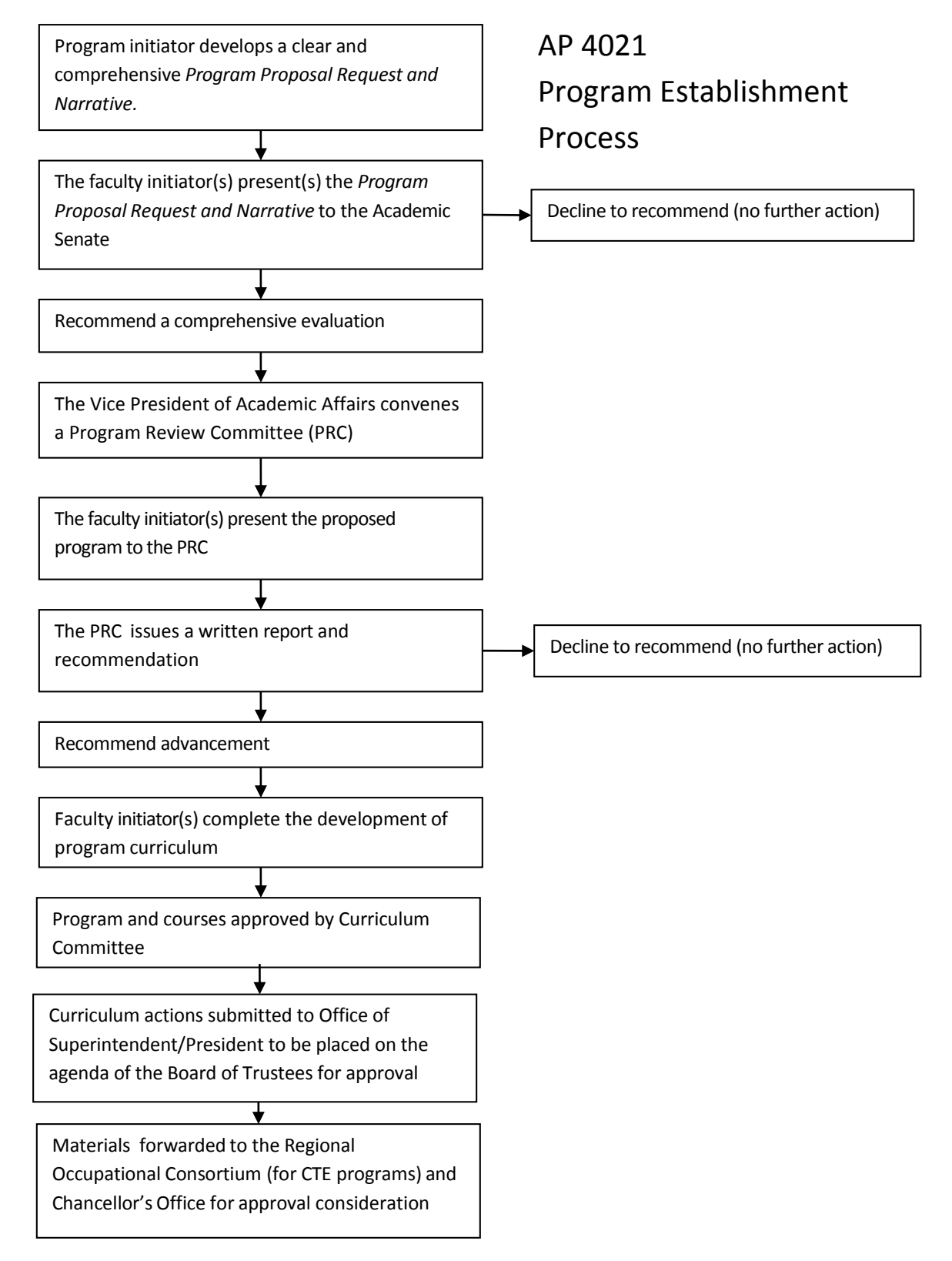
Note: Program initiation will also depend upon identifying appropriate levels and sources of funding.