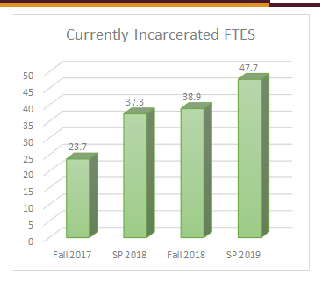
Funded at $5,457 per FTE