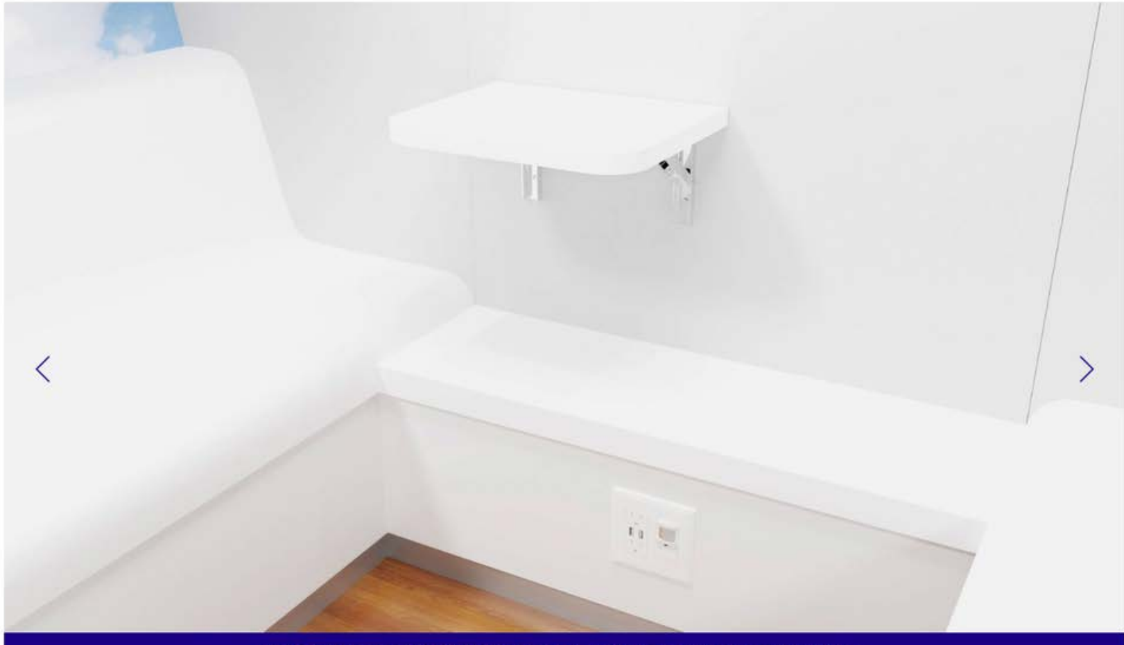
Bench, desk for pump, and usb + outlet