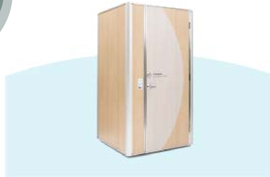
Mamava Solo Base