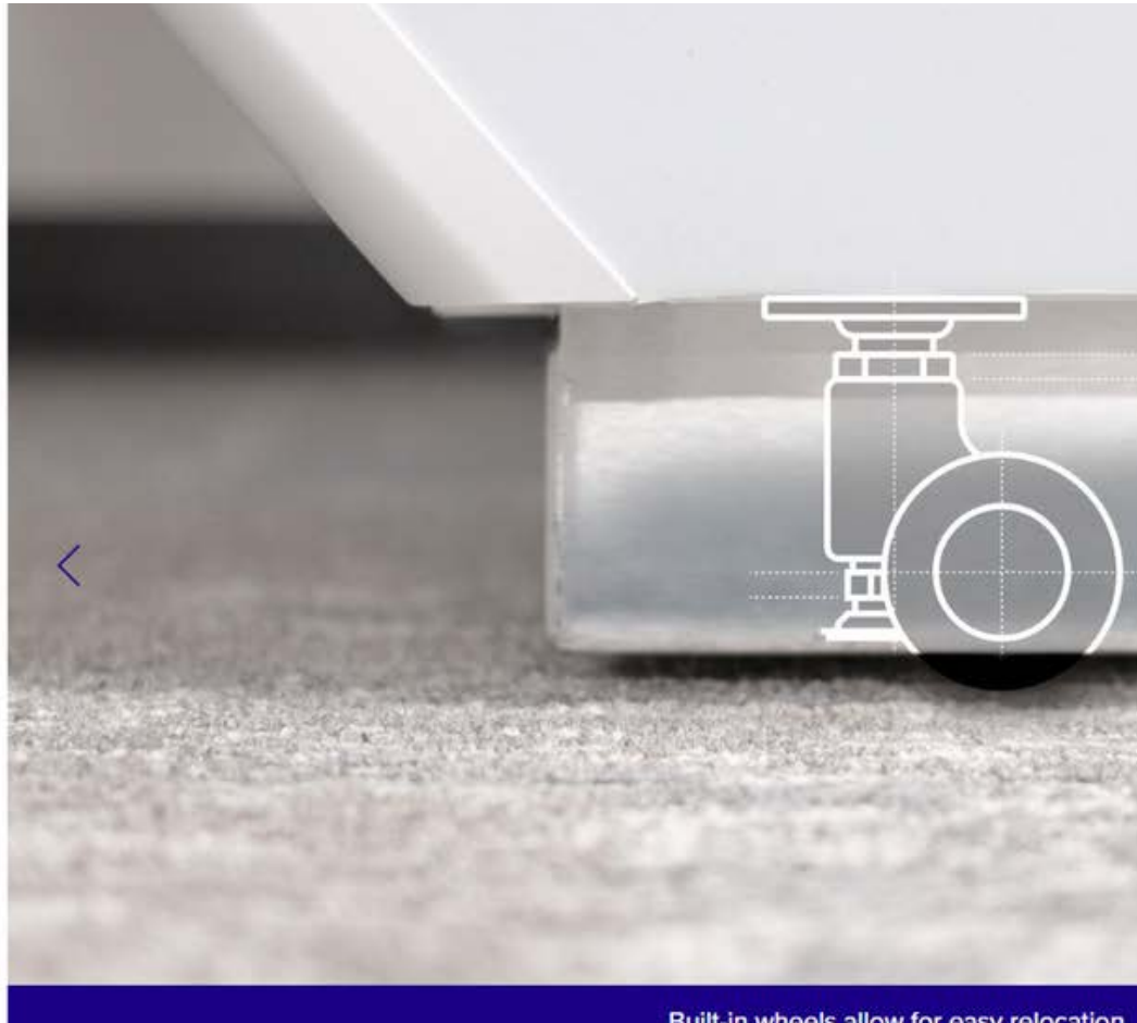
Wheel Casters for easy movement