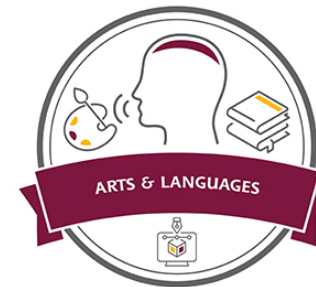
Arts & Languages